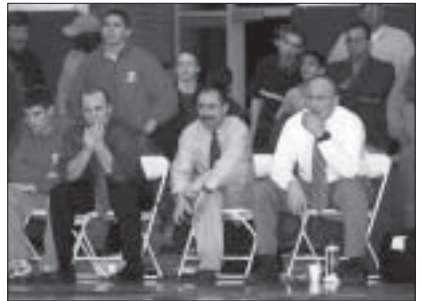
The VMI Coaching Staff